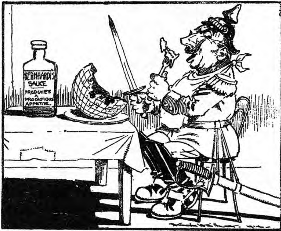
A cartoon published in Britain early in 1914. It is entitled 'The Kaiser's Dream: The End of the World'. Bernhardt was a German general who wrote a best-selling book entitled 'Germany and the Next War'.