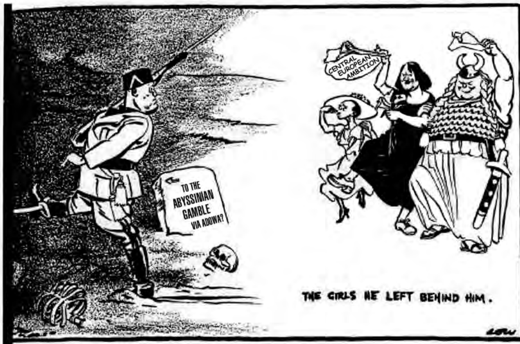
A British cartoon published in May 1935. The three figures on the right are Hitler and two of his leading ministers.